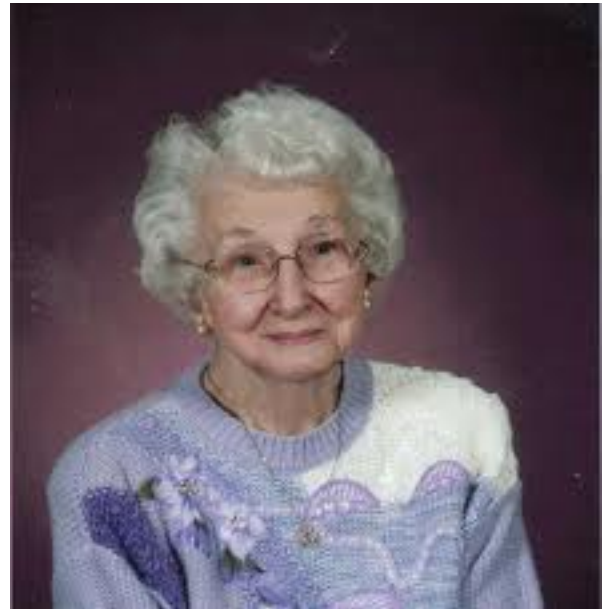
Cookie Baking Grandma